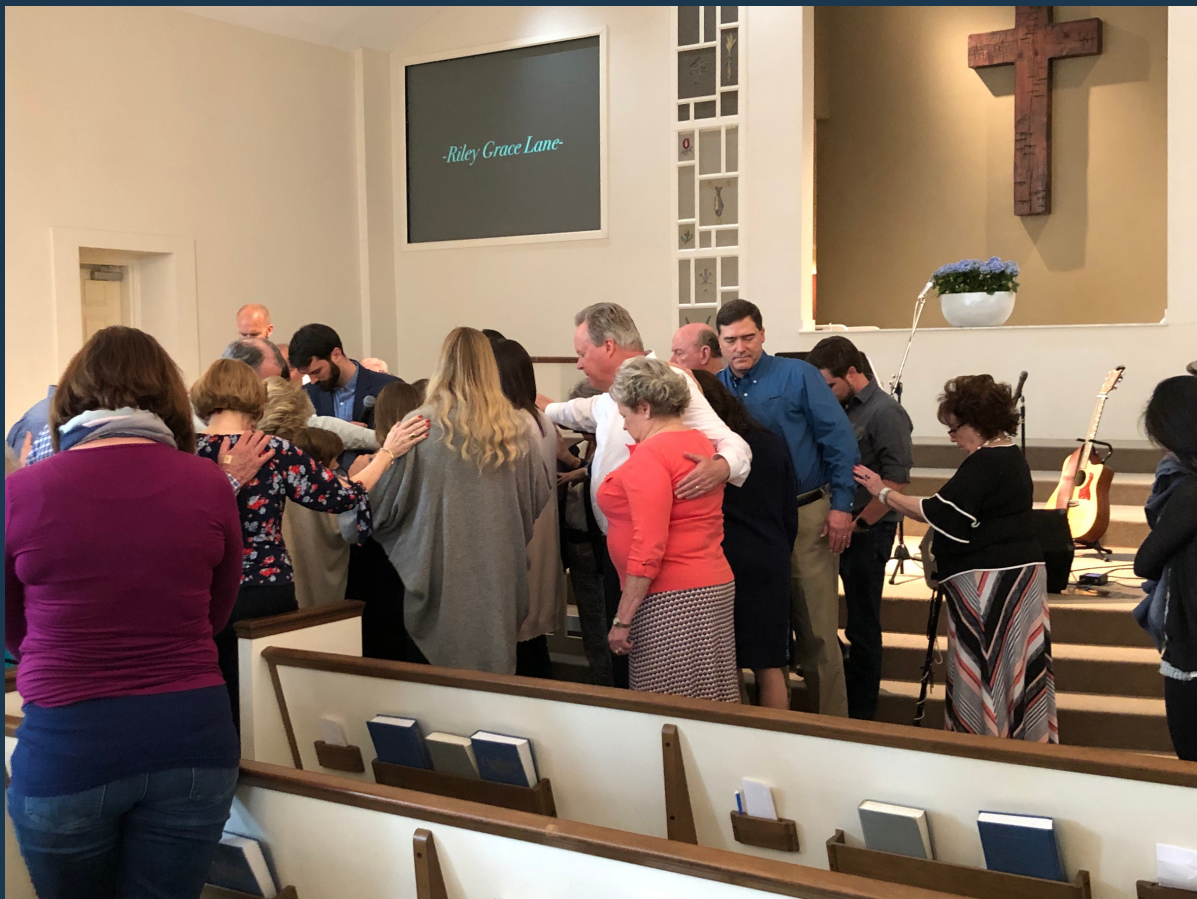
New member announcement