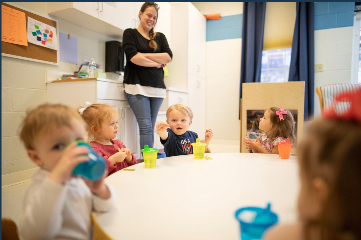
Mother's Day Out Class